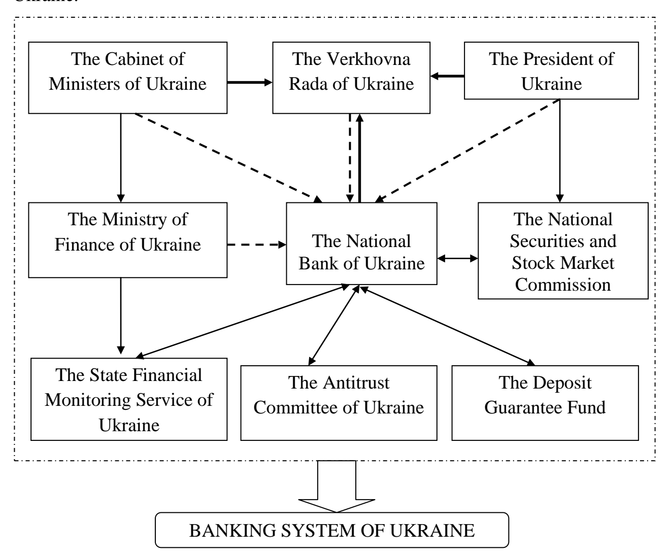
Fig. 1. The banking activity government regulation system in Ukraine.

Despite the significant number of government bodies, the National Bank of Ukraine is one and almost the single regulator in this sphere, and its links to other