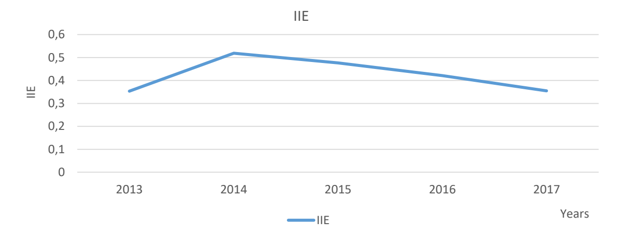
Figure 2. Dynamics of the general level of development of export-import activity of PAT "Turboatom"

environment at the level of development of exportimport activity of the enterprise, it is necessary to calculate multifactorial regression models. Such models of influence of environmental factors at the level of development of export-import activity of PAT "Turboatom" are as follows: