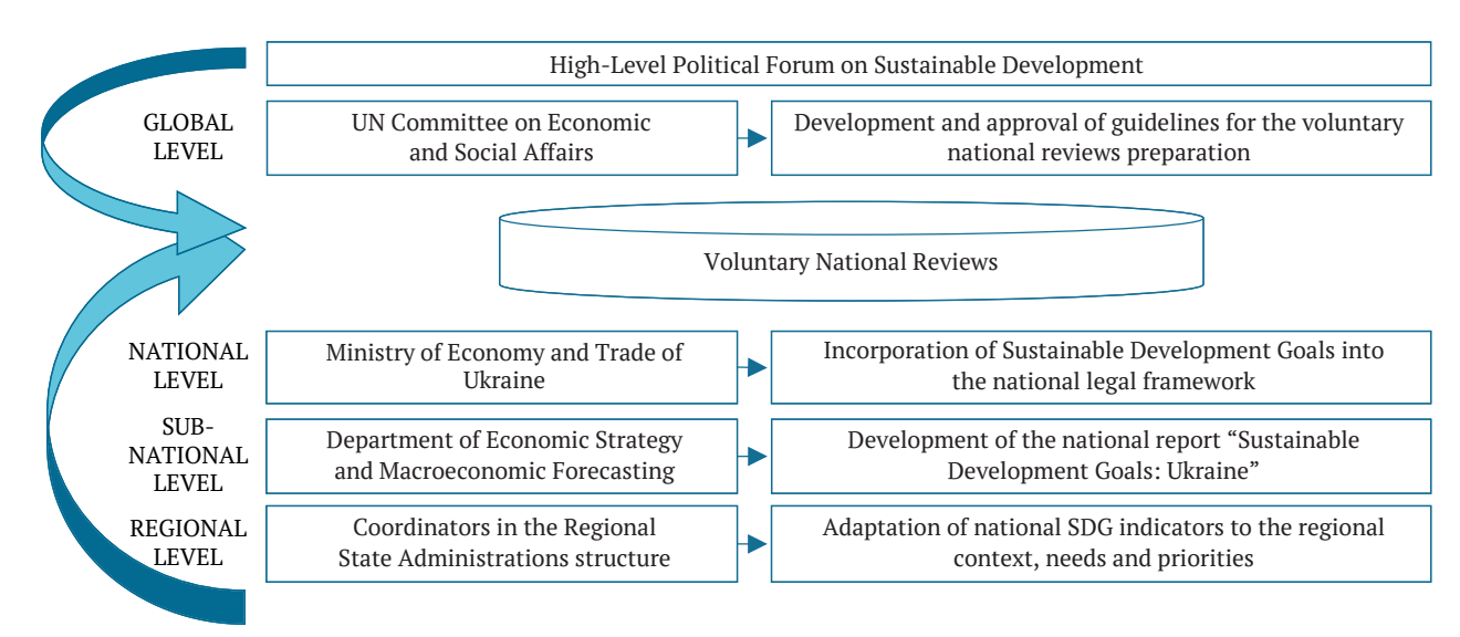
Figure 1. Institutional mechanisms for strengthening the harmonization and comparability of reporting on sustainable development at the international level in the context of achieving the SDGs

Before the full-scale invasion of Russia, Ukraine has already made significant efforts in the process of forming a national institutional model for ensuring achievement of the SDGs. A High-level group, connecting 17 working subgroups corresponding to each goal, was created in Ukraine as a part of the sustainable development tasks contextualization. More than 800 specialists in all regions of Ukraine participated in the process of defining the national sustainable development goals in institutional, economic, ecological and social areas (Sustainable development..., 2017; Iefymenko, 2019). Established institutions ensure laws and strategies development as well as data collection for assessing the indicators of the SDGs achievement. The national policy of Ukraine, developed by the Ministry of Economy and Trade of Ukraine, incorporating the goals of sustainable development into the national legal framework, was coordinated with the Central Development Strategy (Fig. 1).