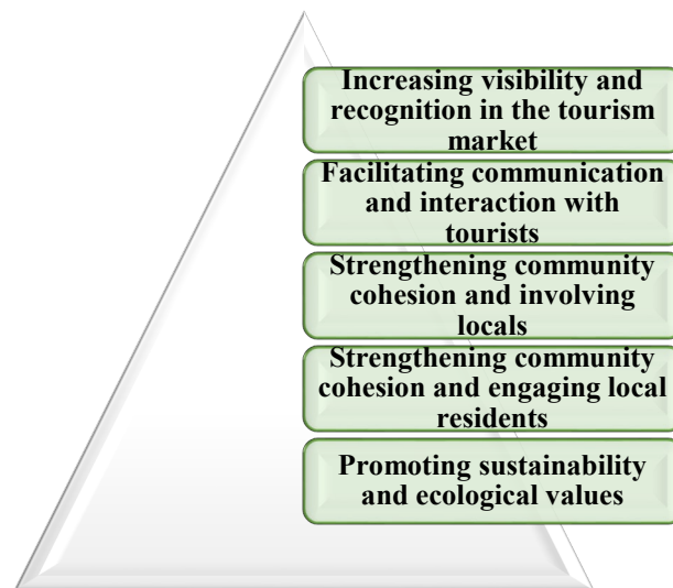
Figure 4. The impact of the local brand and the digitalization of tourism identity

The local brand and the digitalization of the tourism identity have played a crucial role in the transformation and sustainable development of Puhāceni as a rural tourism destination (Figure 4).